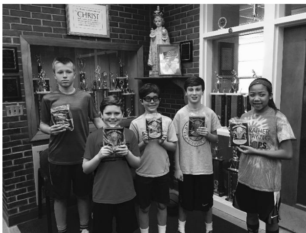
2016 Knights of Columbus Champion Free Throw Shooters

EVERY Thursday evening, 7-9:00 pm, in our Adoration Chapel, the Chaplet of Mercy, 7 Sorrows of Our Blessed Mother and 15 decades of the Rosary are sung and prayed. Please join us!