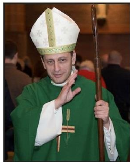
Celebrant and Homilist

Pope Francis' vision of the Church as a Field Hospital: What does it mean to health care providers?