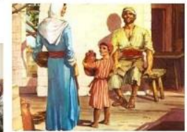
THE HOLY FAMILY